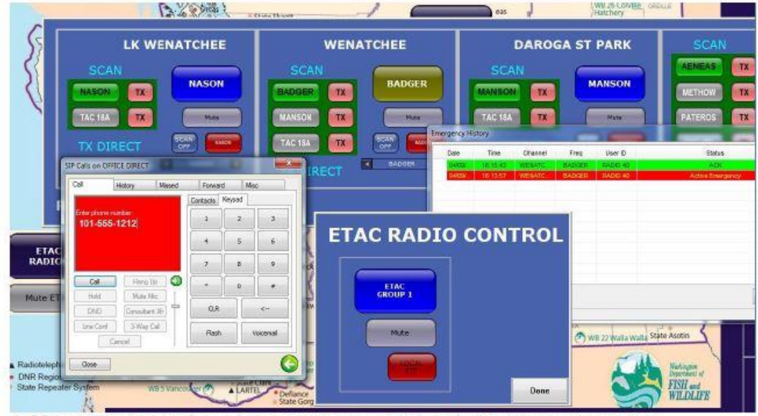
Adding SIP, Smartphone integration via ETAC and Man Down Emergency Figure 2 Next Phase for WDFW

Targeted Technology Integration allows WDFW to achieve full Statewide PSAP status for Wildlife incidents in just over 2 years.