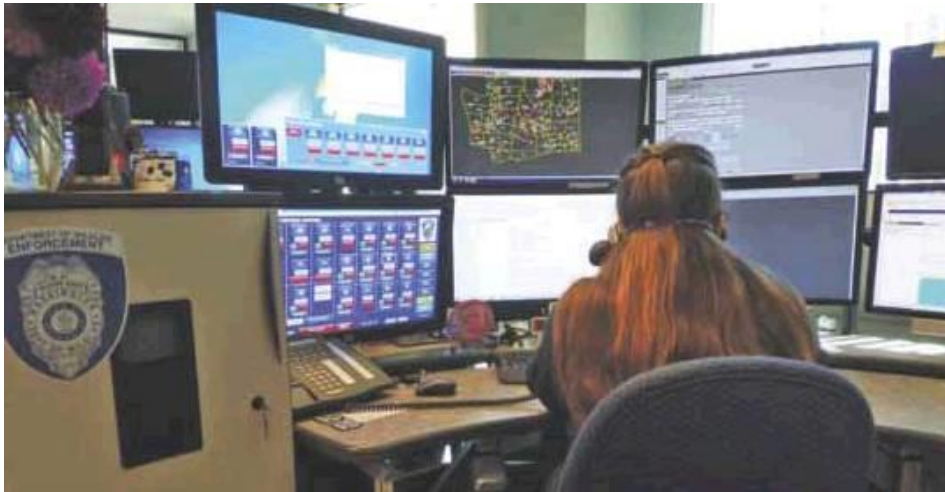
WILDCOMM Dispatch in Olympia

communications between its headquarters in Olympia, its statewide local and regional offices, and more than 150 field officers patrolling some of the most rugged, isolated geography in the United States. With a modest budget to meet those enormous needs, the department turned to Kenmore, Washington-based Phase 4 Design, which specializes in advanced radio communications solutions.